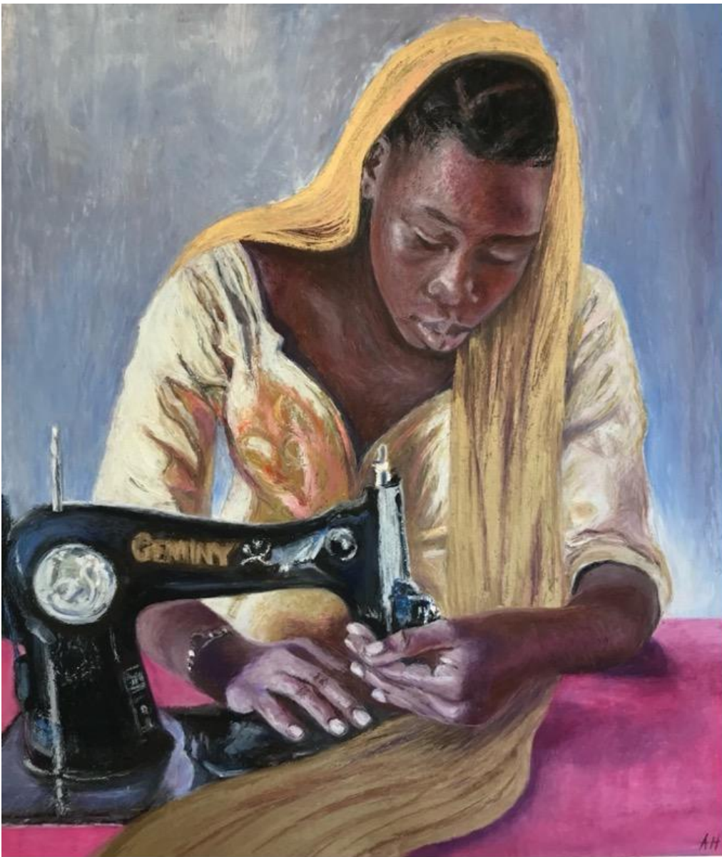
Medium: Oil pastel