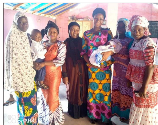
Young mothers - students on PAD's young mothers sewing and tailoring course