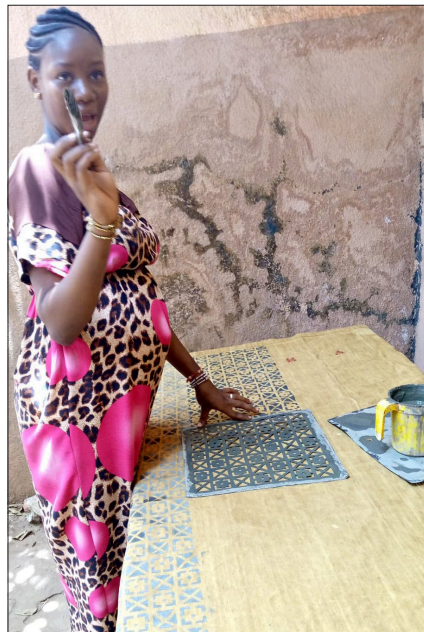
Young woman doing bogolan course