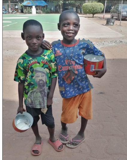
Boys begging on the streets

Overall, in its small way, PAD is going from strength to strength, coping with the current cost-of-living pressures, internal movement of displaced people, political insecurity and general poverty, while maintaining and extending links with local and international partners, and responding to new opportunities in the currently very difficult context of life in Mali.