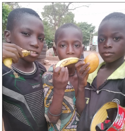
Proceeds of begging by young street children